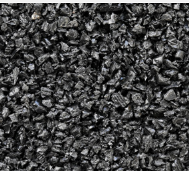
Big rubber granulate