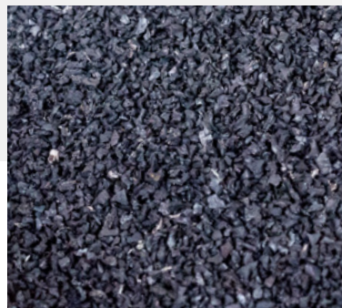
Fine rubber granulate